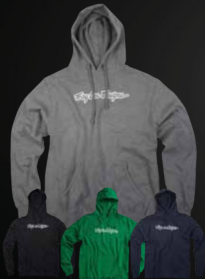
280g 80% cotton, 20% poly, basic pullover hood, plastisol front graphics. Essentials item.