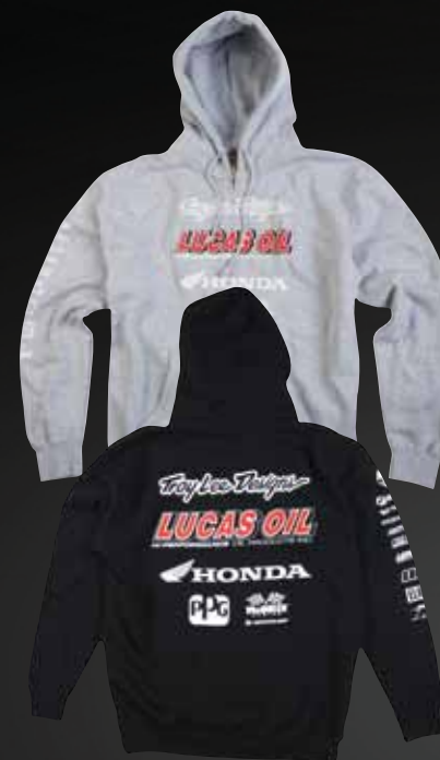
330g 80% cotton, 20% poly, basic zip-up hood, plastisol front/back/arm graphics