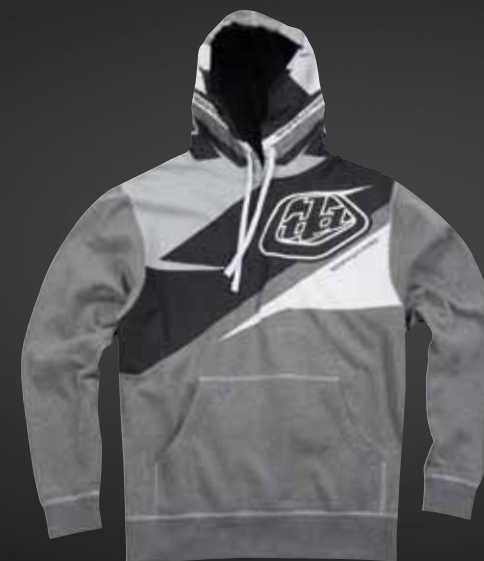
280g 80% cotton/20% poly fleece, allover hood graphic, front/back graphic inspired by TLD Stinger gear, contrast stitching, woven pinch label on cuff