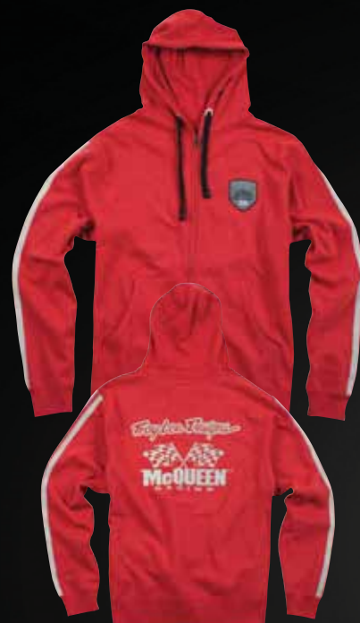
280g 80% cotton/20% poly fleece, custom woven patch, flock print on back & flock accent arm stripes