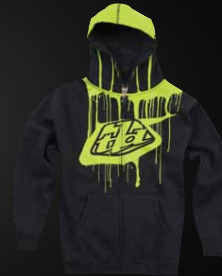
280g 80% cotton/20% poly fleece, allover front/hood graphic, woven pinch label on cuff