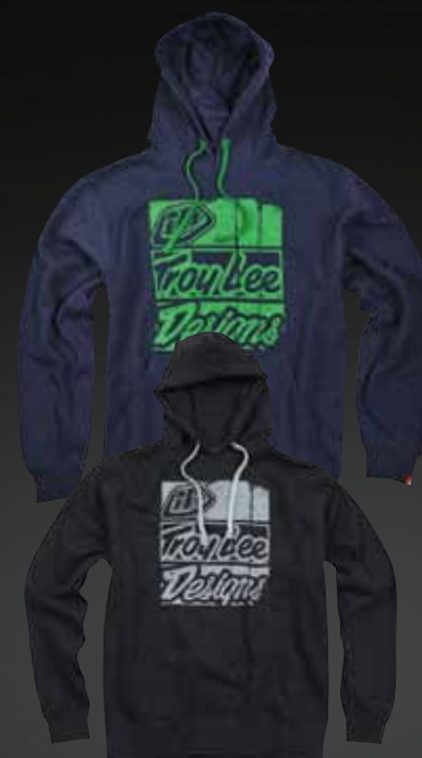
280g 80% cotton/20% poly fleece, front chest graphic, woven pinch label on cuff