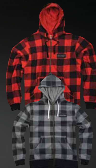
280g 80% cotton/20% poly fleece, allover plaid pattern print, antique brass zip/eyelets, contrast zipper tape, woven pinch label on cuff