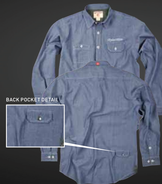
BACK POCKET DETAIL

100% cotton chambray, pre-laundered for soft hand, contrast pocket details, chest screenprint, woven pinch label, slim fit