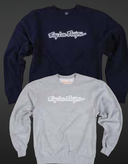
330g 80% cotton, 20% poly, basic crewneck sweater, plastisol front graphics. Essentials item.