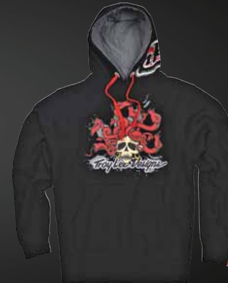
280g 80% cotton/20% poly fleece, front screenprint inspired by TLD Medusa gear, woven pinch label on cuff