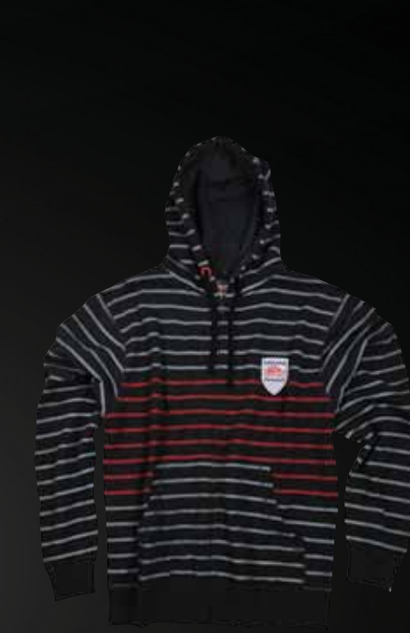
280g 80% cotton/20% poly fleece, allover stripe pattern, custom woven patch, woven pinch label on cuff