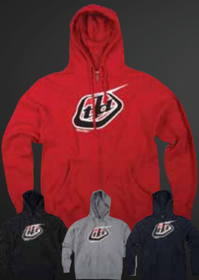
280g 80% cotton, 20% poly, basic zip-up hood, plastisol front graphics. Essentials item.